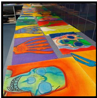
Year 7 Exploration of Media (Arts Class)

With activities week coming soon, make sure your selection forms are filled in and submitted to the front office.— Mr Pattie