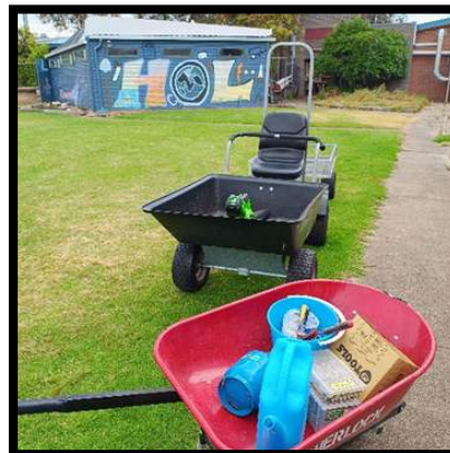
Another day, another job, another learning experience. Hands-on Learning equipment with their hut in the background.

ON THURSDAY 7.2 INVESTIGATED the solar energy absorption properties of the different states of matter. As part of our unit on renewable and non-renewable energy, we wanted to see whether sand, water or air would warm up the most during a 30 minute period in the sun. We discussed the application of this in the design of solar energy technologies. This was a great way to practice our Science Inquiry Skills ahead of our CAT next week which will ask students to apply these skills in unseen scenarios.